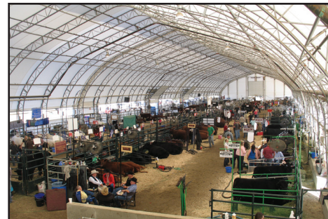
Olds, Alberta, Canada

The town of Olds is an agricultural center located 45 minutes north of Calgary and the host hotel of the WHC. The town is renaming itself "Herefordville" for the week of July 12-18, 2012 to promote the WHC and the Hereford events being held in Olds. The Olds Agricultural Society facilities have been designated as the location for all of the cattle show events, including a Junior Cattle Show and Ranch Rodeo.