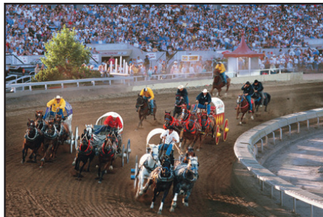
The Calgary Stampede The Greatest Outdoor Show on Earth